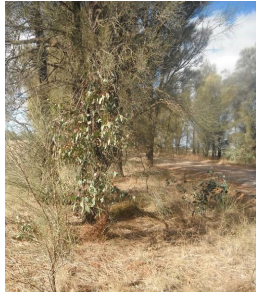
Figure 6 High conservation value roadside in the Shires' west, a 'Plains Woodland'. Although narrow it contains locally significant flora, Buloke, and has an endangered regional conservation significance.