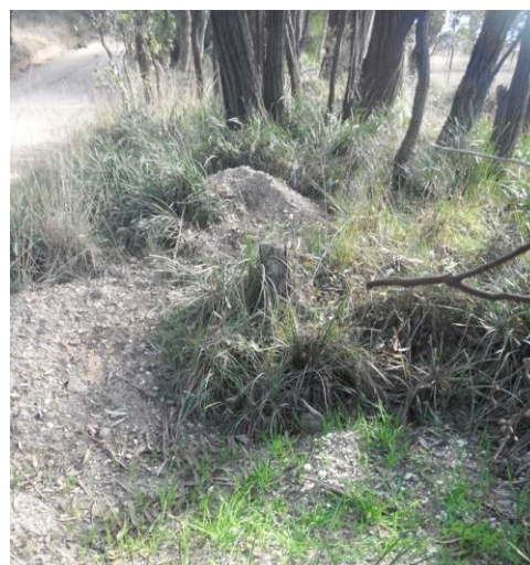
Figure 9 A medium and high conservation value roadside with weeds growing in spoil.

All functional values of roadsides must minimise disturbance of vegetation and soil. Such disturbance promotes invasion of weeds, spread of pathogens, and increases the risk of soil erosion and possible pollution of waterways. All of these problems may require expensive long-term management. Therefore it is sound environmental and business practice to keep disturbance to a minimum, whatever the scale of works that are being undertaken.