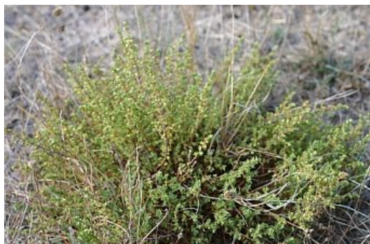
Figure 5 The critically endangered Spiny Rice-Flower, as listed under the Environment Protection and Biodiversity Conservation Act 1999 , occurs on two known roadsides in the Shire.