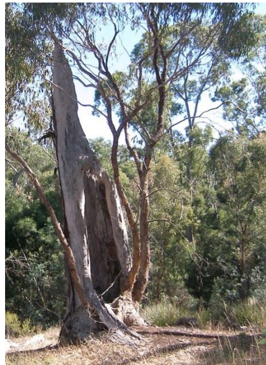
Figure 8 This scarred tree on a roadside is protected by the Aboriginal Heritage Act 2006 .

The Victorian Heritage Act 1995 , administered by Heritage Victoria, defines non-indigenous cultural heritage to mean places and objects of cultural heritage significance. The Act prohibits the destruction or disturbance of any cultural heritage site, place, or object, whether on private or public land. Where harm is unavoidable this legislation provides legal mechanisms for resolution via a permit application for proposed works. Further to this council can play a role in protecting cultural heritage through provisions in the planning scheme such as a Heritage Overlay.