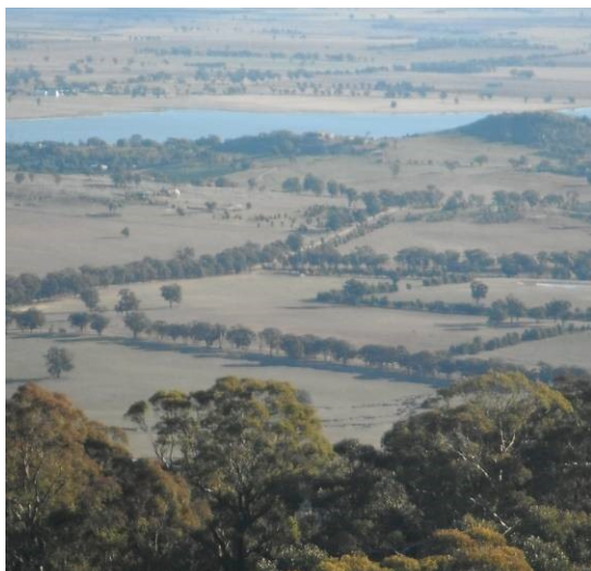
Figure 3 Looking west from Mount Tarrangower, Maldon. The role of roadside vegetation is clear: it provides vital linkages between larger blocks of native vegetation.

In the Goldfields bioregion the Box-Ironbark ecosystem dominates the relatively poor soils that support fragmented native forests and woodlands. The more fertile areas are dominated by the Valley and Riverine Grassy Woodlands. The flatter and more fertile productive areas of the Central Victorian Uplands bioregion were once dominated by forests and woodlands. The Victorian Volcanic Plain bioregion is characterised by open grassland areas, patches of open woodland, stony rises denoting old lava flows, the low peaks of extinct volcanoes and scattered lakes. The Victorian Riverina Bioregion is characterised by flat to gently undulating land on recent unconsolidated sediments with evidence of former stream channels. Plains Woodland and Plains Grassland Ecological Vegetation Classes (EVCs) were the predominant vegetation communities here. The species-rich woodlands are characterised by low density tree cover with an understorey of scattered shrubs and a well developed grassy layer.