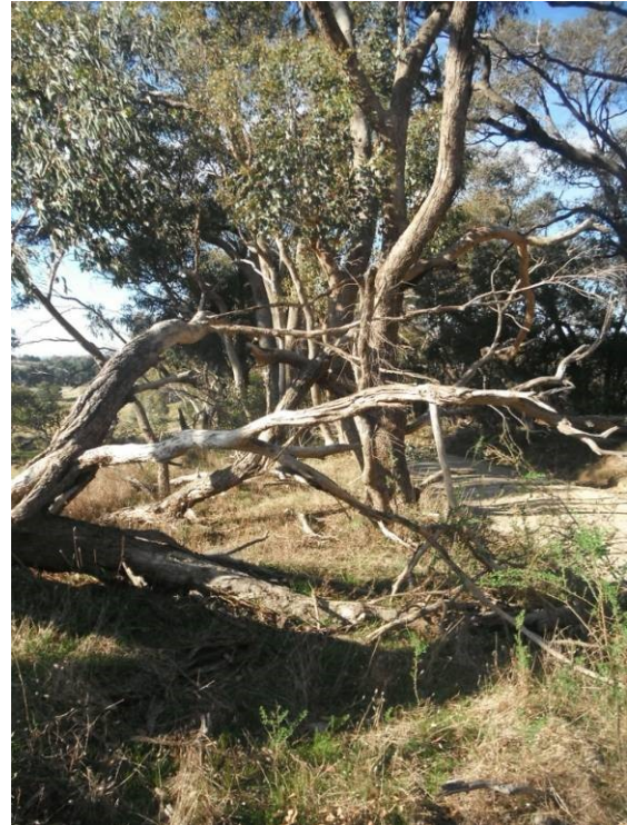
Figure 8 A medium conservation value roadside in the Shire's east where the fallen branches and limbs add directly to the conservation value of the roadside.

The Municipal Fire Prevention Officer will monitor and evaluate fire prevention works to determine the effectiveness of works in terms of fire management and the impact on vegetation quality.