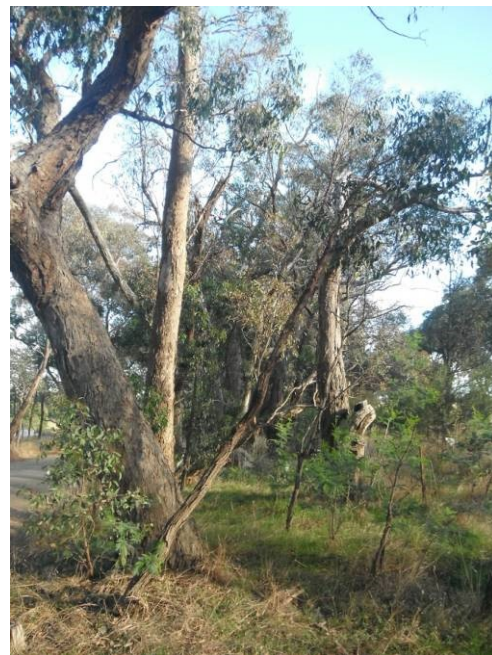
Figure 4 A high conservation roadside in the Shires' east that contains large old trees, dead standing trees, woody shrubs and a mostly native plant ground layer.

The State Government policy surrounding roadside weed management may change in the near future, with new funding programs and expectations being mooted. For this reason, this Plan will be reviewed within twelve months of adoption to ensure it remains consistent with State legislation and policy.