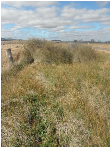
Figure 7 High conservation value roadside in the Shire's west. This wetland is part of the wider Moolort wetland complex that has regional conservation significance and is part of the Victorian Volcanic Plain, Victoria's only National Biodiversity Hotspot.