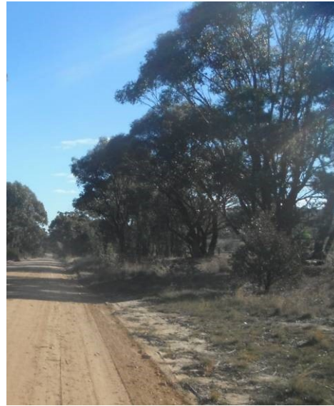
Figure 1 A high conservation roadside in the Shire's north that contains large old trees, dead standing trees, fallen branches, woody shrubs and a native plant ground layer.

The previous Mount Alexander Shire Council Roadsides Management Strategy (1998), prepared by the Mount Alexander Roadsides Management Working Group, has provided a basis for this Plan's development. This new Plan builds on the work undertaken by Council and the community and brings together new ideas, concepts and available data to make informed management decisions.