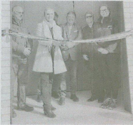
☆ Harcourt Recreation Reserve's new female-friendly change rooms.

HARCOURT Lions football, netball, cricket, and tennis clubs, along with the Mount Alexander Falcons (Women's Football Club), can look forward to preparing for the big games in a new female-friendly pavilion, thanks to the completion of works at Harcourt Recreation Reserve.