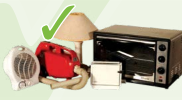
YES household appliances