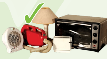
YES household appliances