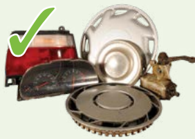
YES car parts