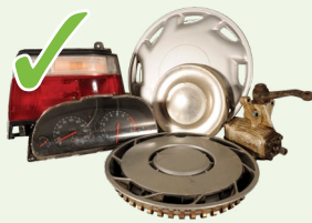
YES car parts