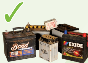
YES Automotive batteries