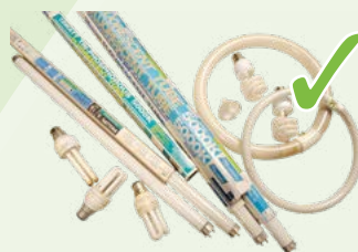
YES Compact fluorescent lights and tubes