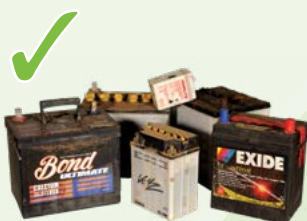
YES Automotive batteries