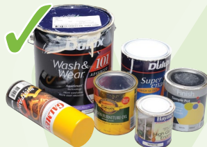
YES Paint (dry only)