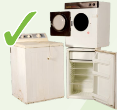
YES white goods