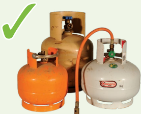
YES Barbeque gas bottles