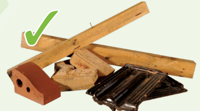
YES bricks, rubble, timber or tiles