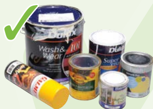
YES Paint (dry only)