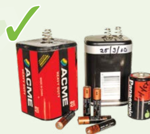
YES Household batteries