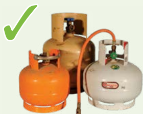
YES Barbeque gas bottles