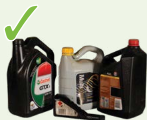
YES Motor oil

You can find more information by visiting www.sustainability.vic.gov.au