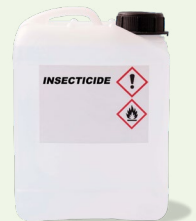
YES drumMUSTER labelled containers accepted. Must be washed clean of chemical and subject to inspection upon entry