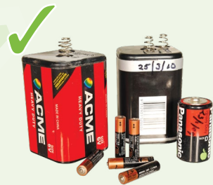
YES Household batteries