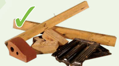
YES bricks, rubble, timber or tiles