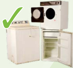
YES white goods