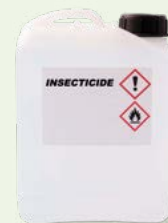
YES drumMUSTER labelled containers accepted. Must be washed clean of chemical and subject to inspection upon entry