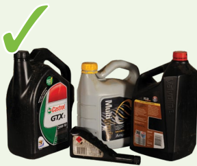
YES Motor oil

You can find more information by visiting www.sustainability.vic.gov.au