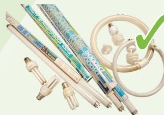
YES Compact fluorescent lights and tubes